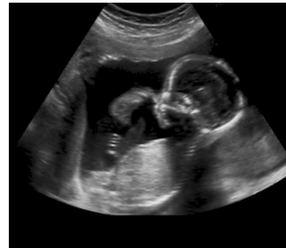
Our current images

We are blessed to be able to serve the community and our clients as we distributed car seats through our partnership with Saint Christopher's. A class was held on March 9th and attendees were educated about child safety. All who completed the course received a brand new car seat. Thank you, Saint Christopher's!