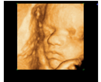
coming soon... 4d images!